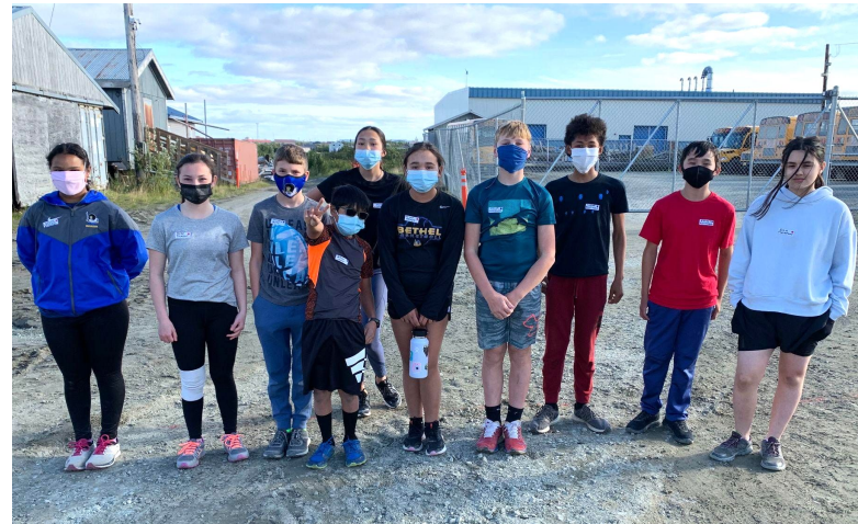
JH cross country runners.

The BRHS junior high cross country team competed in the Crane Run with Warrior power to the finish line on August 27.