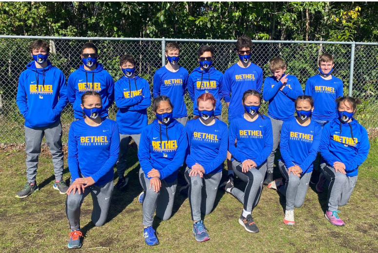
BRHS high school cross country team at their last meet in Palmer, AK.

The BRHS high school XC team went to Colony High School for the 5,000 Open Race, and the Varsity Race on August 28, 2021.